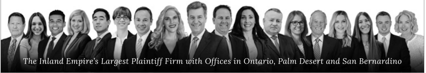
The Inland Empire's Largest Plaintiff Firm with Offices in Ontario, Palm Desert and San Bernardino

McCUNE · WRIGHT · AREVALO ATTORNEYS AT LAW