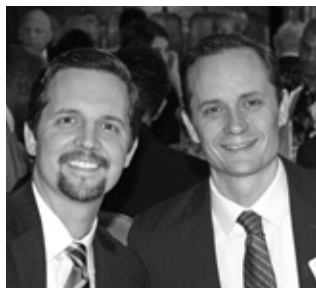
Commissioner Nicholas Firetag and Judge Chad Firetag