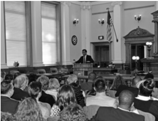
Justice Richard T. Fields addressing attendees in Department 1 of Riverside Superior Court