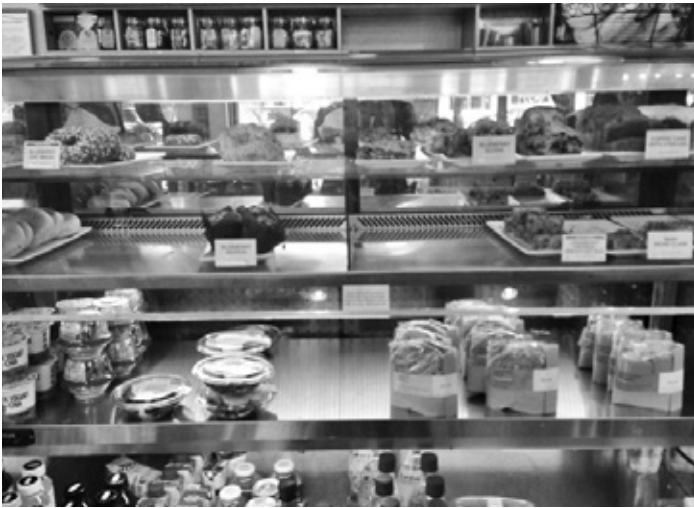
The shelves of a local coffee shop are depleted towards the end of the business day.

of his bag to remove a cover plate the owner had secured over an outlet,” several years ago issued a list of “15 Tips for the Wi-Fi Workforce.” 26 The recommendations include “leave chairs free,” “take one chair, and the smallest table available,” “don’t bogart bandwidth,” and “recognize that everyone wants the outlet seat.” More than anything, the author counsels that customers should remember that they are “frequenting a business.” 27 Recommendations such as buying something through the day (every hour or so), tipping well, and cleaning up after yourself all seem to be components of basic good manners but probably are worth repeating.