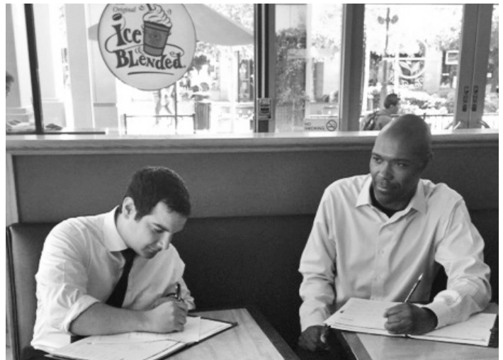
The coffee shop work place.

lowing menu selections: a "Morning Murmur," featuring a "gentle hum (that) gets the day going"; a "Lunchtime Lounge," with "bustling chatter of the lunchtime rush"; and "University Undertones," which includes the "scholarly sounds of a campus café." 23