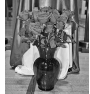
21 Red Roses in memory of members of the legal community who have passed away--may they never be forgotten.