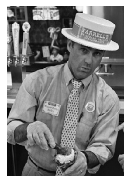
Mayor Rusty Bailey