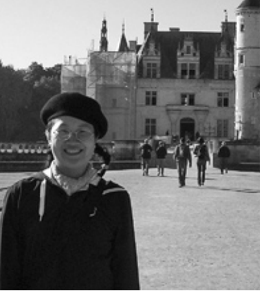
At Chateau de Cenoneau in the Loire Valeey of France, 2009

Her work with the county involves appearing regularly at the Board of Supervisors to handle abatements