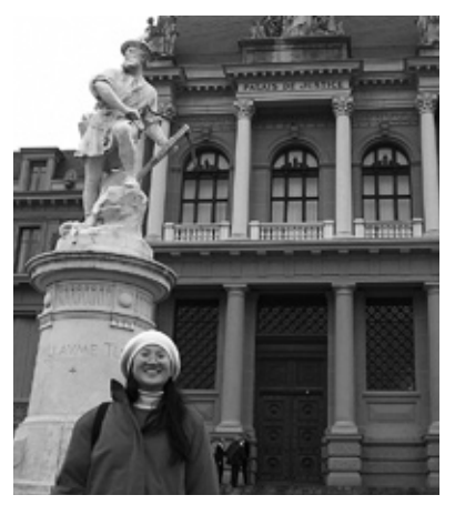
At the Palais de Justice in Lausanne, Switzerland in 2005

She attributes her love of traveling with her sister to the numerous road trips she took with her family while growing up. They visited many national