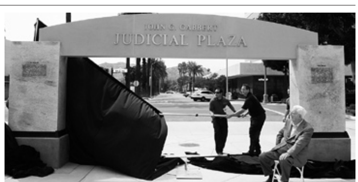
Unveiling of monument in honor of Justice Gabbert (sitting in front)