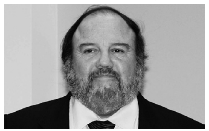
Judge Joe Hernandez, Riverside Superior Court