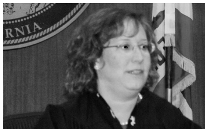
Commissioner Pamela Thatcher, Riverside Superior Court