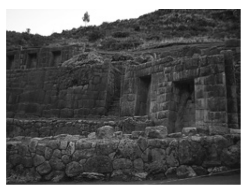
Peru - Incan spa