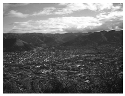
Peru - Cusco as seen from Sacsayhuamán

An hour south of Lima by plane is Cuzco, the former capital of the now-defunct Incan Empire. those of you who slept through World History, the Incan Empire stretched from Colombia to Ecuador to Bolivia to Argentina and Chile. By the time the Spanish conquistadors showed up, in the 16th century, the empire was torn by civil war and imploding under the weight of its own socialist economy.) Cuzco is a checkerboard of 400-year-old churches, whose vaulted ceilings, art-smothered walls, and marble-clad interiors beggar the cathedrals of Europe. They were all