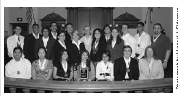
Santiago High School