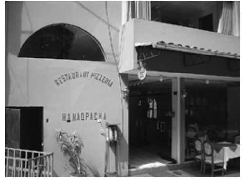
Peru - our hotel

built atop the Incan palaces and temples pulled down by the Spanish and, currently, the locals are not too thrilled about that.