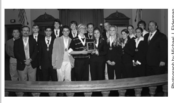
Woodcrest Christian School