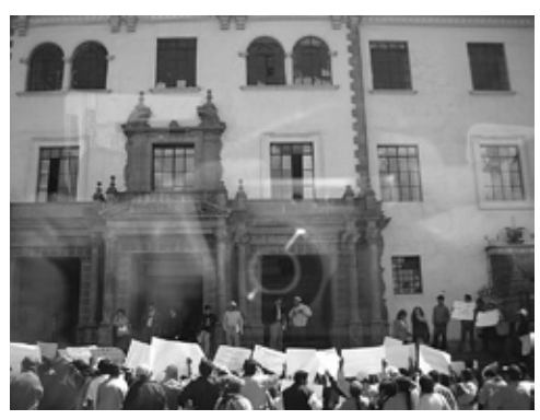
Peru - Cusco court crowd