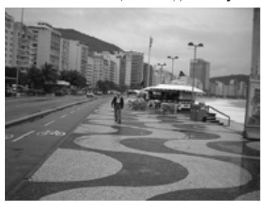
Brazil - Copacabana mosaics

ways on motion sensors, and the room lights cannot be turned on or left on without a room key. Brazil is proud of its energy-conservation policies, but it also boasts over 600 "favelas" (slums), many of which surround Rio.