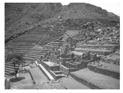
Peru - Machu Picchu overview