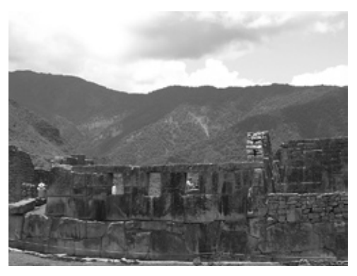
Peru - Machu Picchu temple