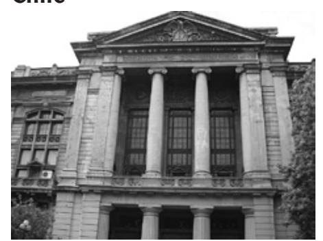
Chile - Santiago courthouse

If you've always wanted to vacation in a gulag, Chile is the place for you. It costs $100 just to get into the country and, if Santiago is any indication, there is nothing to see. Chile grows a lot of grapes. You can have any wine you want, as long as it's Cabernet. The wine is palatable, but you can't drink enough of it to make you forget that you're in Chile.