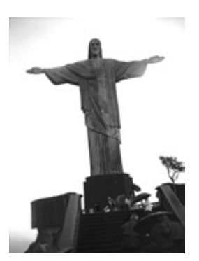
Brazil - Christ of Corcovado

Twenty percent of the cars in Brazil run on ethanol, and over thirty percent run on natural gas (ethanol sells at half the price of gasoline, which costs about one dollar per liter). There are so many buses in Rio de Janeiro, there are bus traffic jams. And, even though Brazil is awash in hydroelectric power – thanks to financing by American banks – the hotels have the lights in the hall-