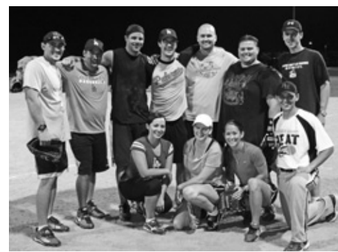
Team District Attorney

One reason for the success of the prosecutors was the high caliber of play