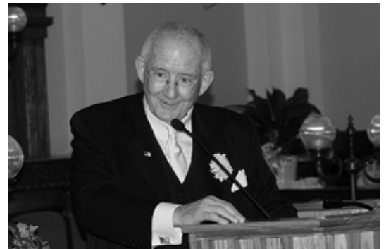
Comments by Jude Thaddeus Powers