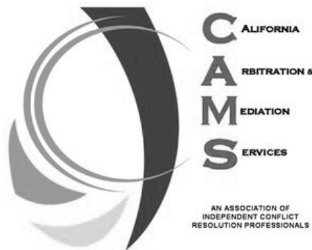
SUSAN NAUSS EXON