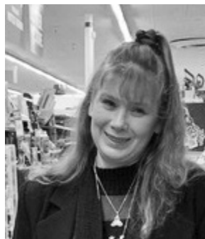
Shopping Elf Barbie Trent