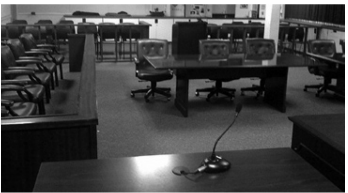
Indio High School's Mock Trial Courtroom View From Witness Stand