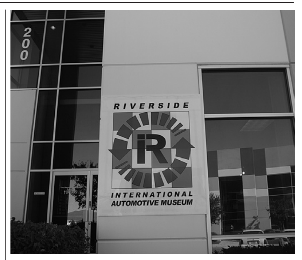
Riverside International Automotive Museum

Grant recalled the day that Lee Petty (the father of stock car hero