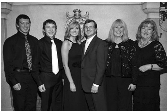
The Kistler Family