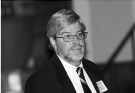
Commissioner Jeffrey Prevost, Riverside Superior Court