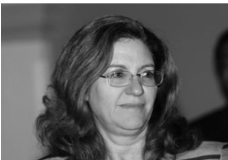
Judge Gloria Trask, Riverside Superior Court