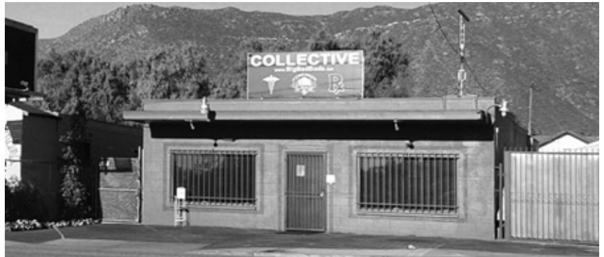
The photo above was taken of a medical marijuana dispensary in the Rubidoux area in the City of Jurupa Valley before the California Supreme Court's decision in the City of Riverside v. Inland Empire Patients Health & Wellness Center, Inc. (2013) 56 Cal.4th 719. The photo below was taken after the decision, which indicates the dispensary was closed, or is it? (Please note the "Open" and "ATM" signs visible through the window.)