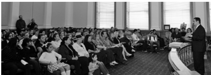
Students, family members and guests in Dept. 1 of Historic Courthouse

The awards ceremony was held on Friday, May 1, 2009, in Department 1 of the Historic Courthouse in Riverside. The following high school students from around the county were recognized for their good citizenship: