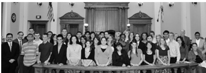
Award recipients and presenters