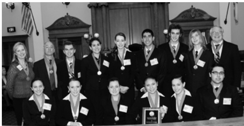
Second Place Murrieta Valley High School