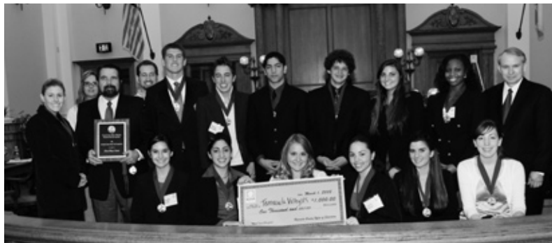
First Place Temecula Valley High School

Based on the results of the first four rounds, eight teams went on to compete in the sin-