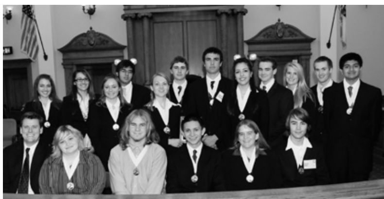
Third Place Hemet High School