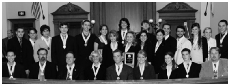
Third Place Woodcrest Christian High School