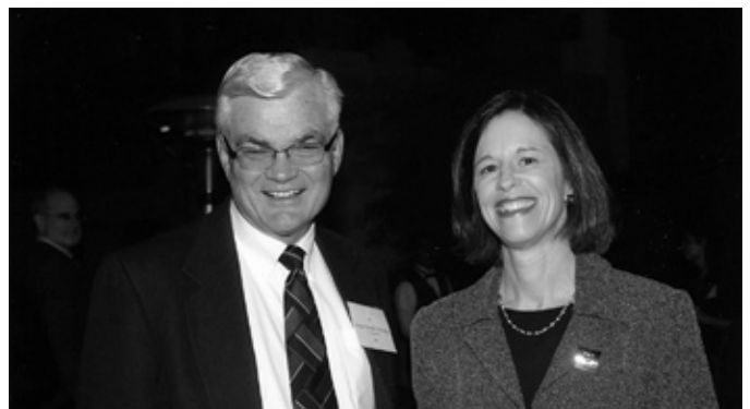
Mayor Ron Loveridge and Magistrate Judge Rita Coyne Federman