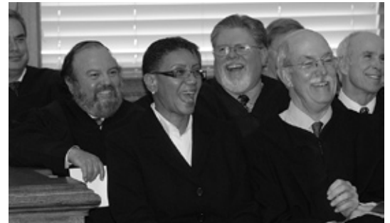
Judges of the Riverside County Superior Court