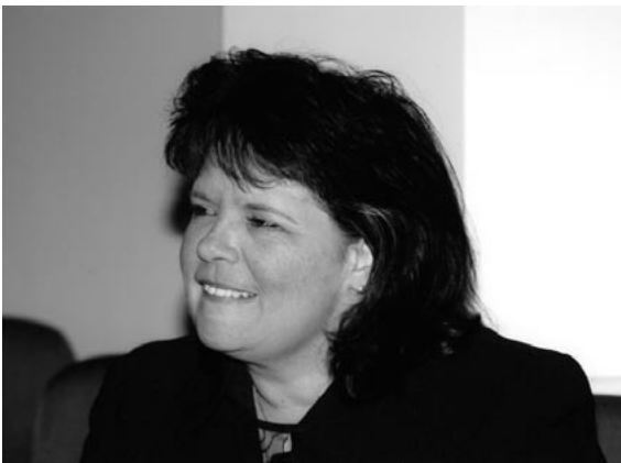
Judge Sharon Waters